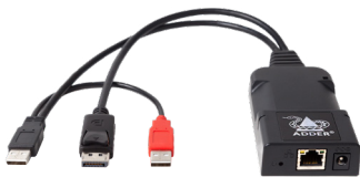
ADDERLink INFINITY 101T - DisplayPort™